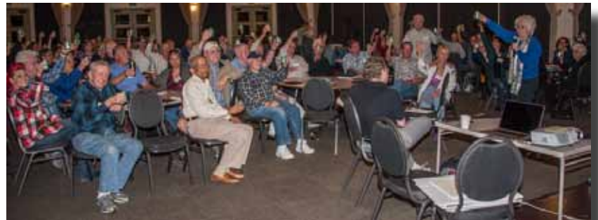
The 7th Year 7-UP Toast